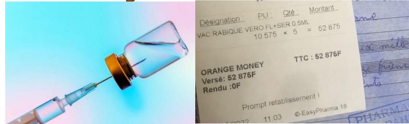
Promoting appropriate management of bite people: access to PEP, Vet observation, Lab confirmation, advocacy for more available et accessible PEP services