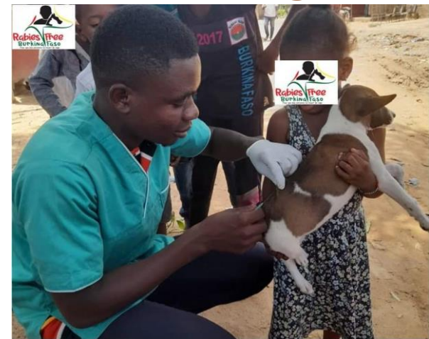
Short vaccination campaigns in the vulnerable communities (dog, cat, monkey)